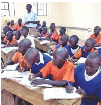
Students at Tiptet Primary School learn in classrooms constructed by the Kenya Child Protection Program.

Administrators, teachers, and/or parents receive training on school management to ensure a gender-sensitive, inclusive school that welcomes girls and boys. Environmentally friendly investments—such as gardens or tree planting on school grounds—enhance the learning atmosphere.