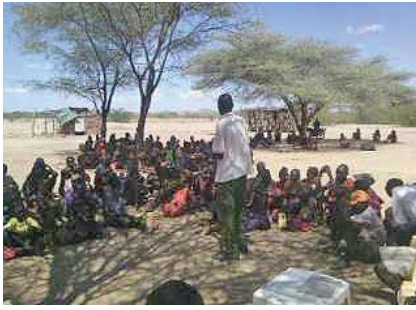
Meetings focused on raising community awareness have provided thousands of Kenyans with information about a child's right to health services, education, and protection from abuse and mistreatment.