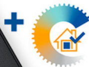
Rider Home Check-in