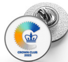
Crown Club Commemorative Pin, special recognition, and more.

*Designs are not final ** Product subject to change