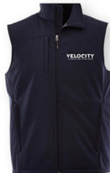
Softshell Velocity Vest**