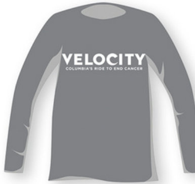
Velocity Long Sleeve Shirt