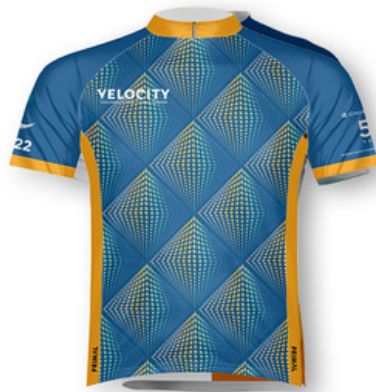
2023 Velocity Cycling Jersey*