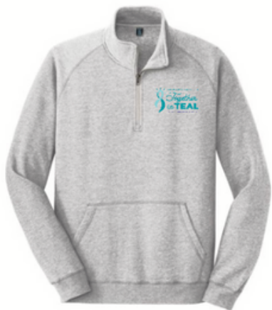
¼ Zip Fleece