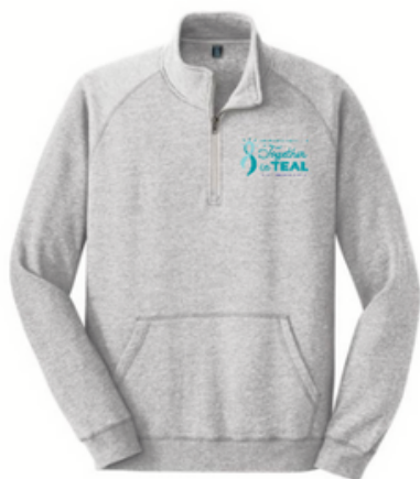
1/4 Zip Fleece