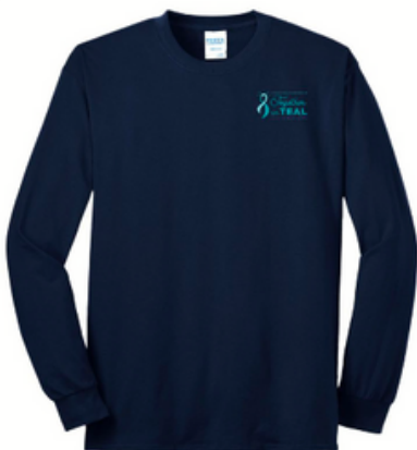
Long Sleeve Tee