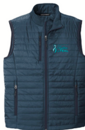
Packable Puffy Vest