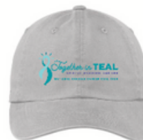
Garment Washed Hat