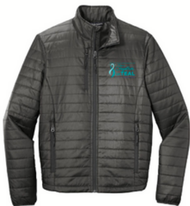
Packable Puffy Jacket