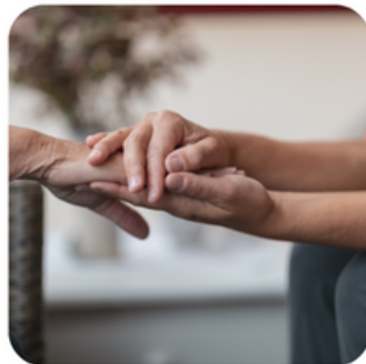
Caregiver Online Support Group