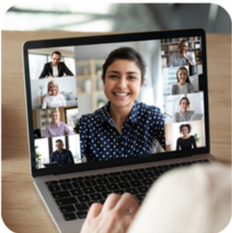
Survivor Peer to Peer Online Support Group