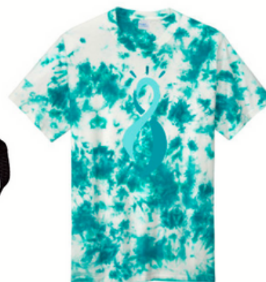
Tie Dye T-shirt