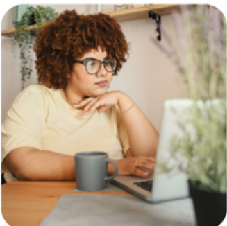
Digital Learning Series