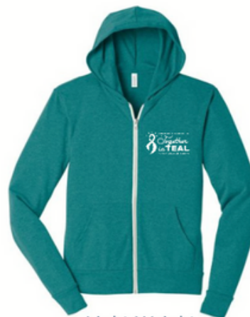
Light Weight Hoodie