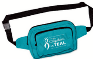
Double Pocket Belt Bag