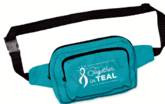
Double Pocket Belt Bag