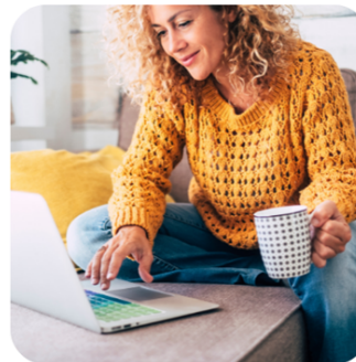
24/7 Online Support Forum