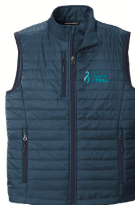
Packable Puffy Vest