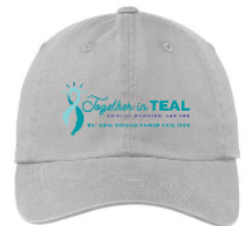
Garment Washed Hat