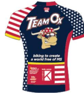
Team Ox City to Shore (NJ)