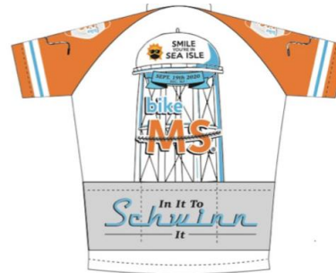
In It to Schwinn It City to Shore (NJ)