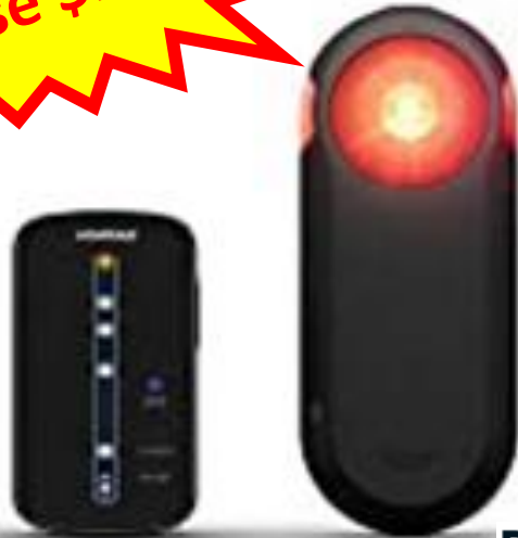
Garmin Varia™ RTL510 Bundle-Rearview Radar (retail $299.99)