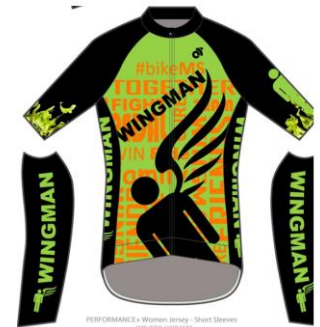
TEAM WINGMAN Valero Ride to the Ride to the River (TX)

Winners Announced Ride Day (Oct 17) @ 12:45 p.m. EDT