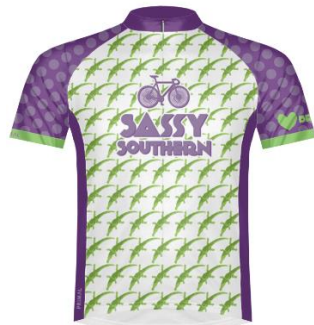
Sassy Southern Dat's How We Roll (LA)