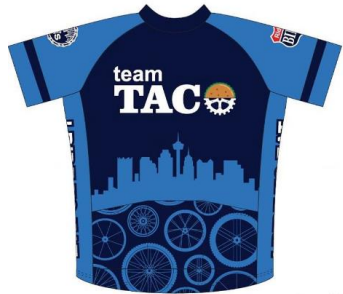
Team Taco Valero Ride to the Ride to the River (TX)