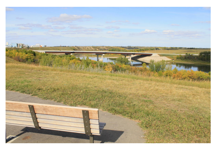
Photo from: https://www.tourismsaskatoon.com/listing/meewasin-trail/238/

www.tourismsaskatoon.com/ listing/meewasin-trail/238/