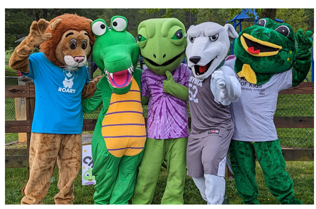
One of the many fun ROAR events—the Mascot Challenge

Early Bird Registration General Event Registration (ends 3/25/2024) (as of 3/26/2024) Adult: $10-$35 Adult: $15-$40 Child: $5-$15 Child: $10-$25