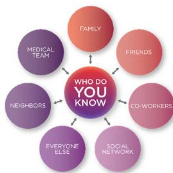
SPHERE OF INFLUENCE

The #1 REASON people do not donate is because they were never asked!