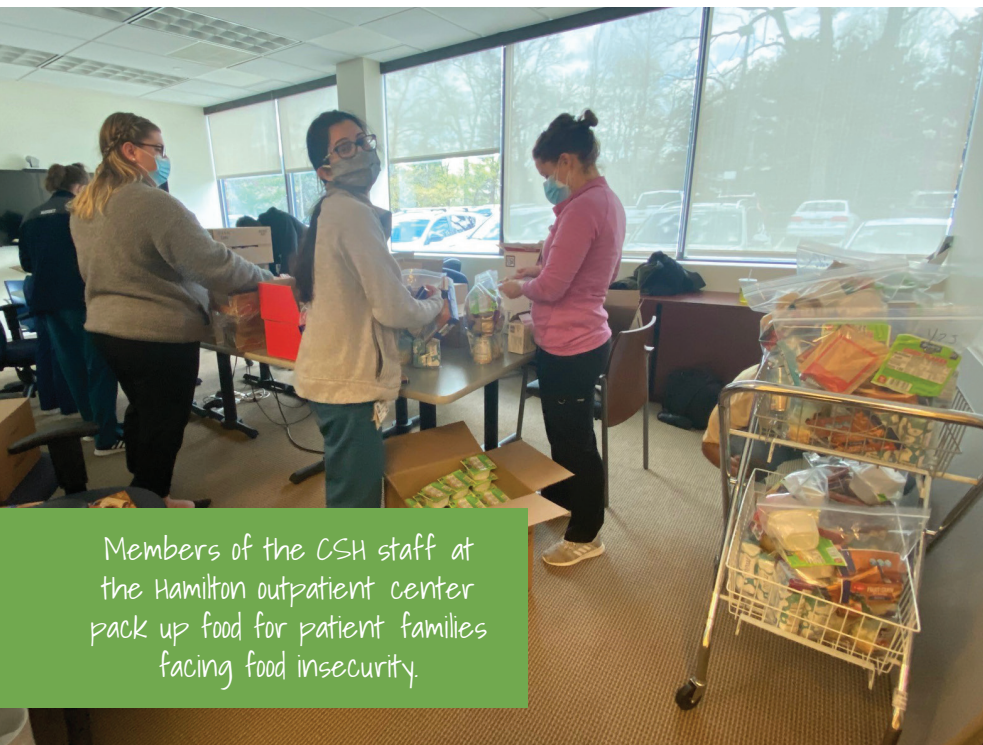
Members of the CSH staff at the Hamilton outpatient center pack up food for patient families facing food insecurity.

S ocial Determinants of Health (SDoH) are defined by the World Health Organization as the "conditions in which people are born, grow, work, live, and age, and the wide set of forces and systems shaping the conditions of daily life." Social determinants of health for children include income level, housing quality, food insecurity, parental mental health, and lack of access to childcare or quality education, all of which affect a child's overall wellness.