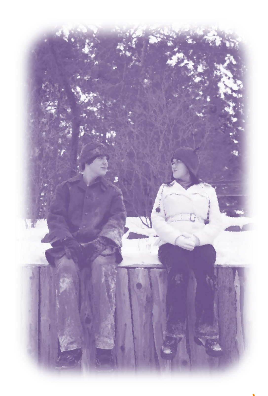
That's what friends do!