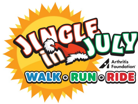
Exhibit Sponsor $1,500