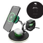
3-in-1 Wireless Charging Station

Fundraising Walk to Cure Arthritis participants at the levels above will be eligible for a fundraising item. To register and fundraise to support the Arthritis Foundation, visit www.walktocurearthritis.org . Fundraising items at the $250 level and above are not cumulative; only one item is awarded to each fundraiser. Fundraisers may select one item at or below the level achieved. Participants will receive certificates to redeem their WTCA item approximately 4 weeks after the event. Certificates will be mailed from the email address arthritisfoundation@pkcomp.com . Please add this email to your address book.