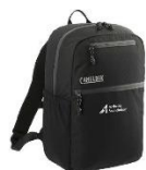
CamelBak LAX 15" Computer Backpack