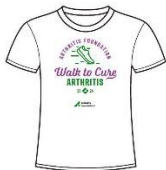
Walk to Cure Arthritis T-shirt