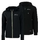
Cutter & Buck Black Hooded Sweatshirt