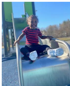
Benji Youth Honoree