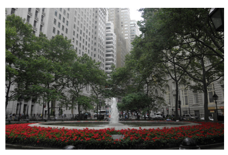
Bowling Green, the oldest public park in NYC (designated in 1733)