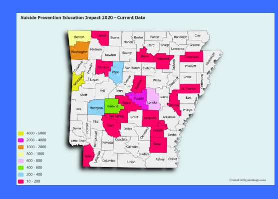
The Arkansas Chapter of AFSP hosts 6 Community Walks all over the state.

In 2023, the Arkansas Chapter of AFSP provided 105 programs to 4, 659 individuals.