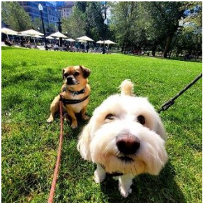
Friendly, leashed pups welcome!