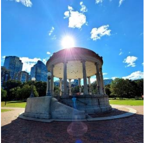
Starting and ending at the Parkman Bandstand!