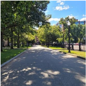
Lots of room to safety distance while walking!