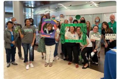
Florida Annual State Capitol Day!

Our Central Florida Chapter Volunteers help to deliver Talk Saves Lives, safeTALK, and It's Real Teens and Mental Health!