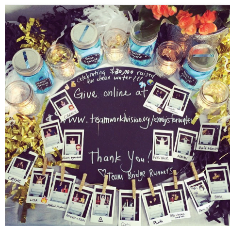
19 likes cschlough after party 🏃🌍💧 congrats to all our costume contest winners & thanks for the donations to the kids! #emojisforwater #teamworldvision